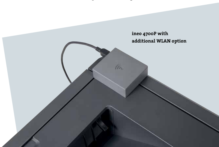
ineo 4700P with additional WLAN option