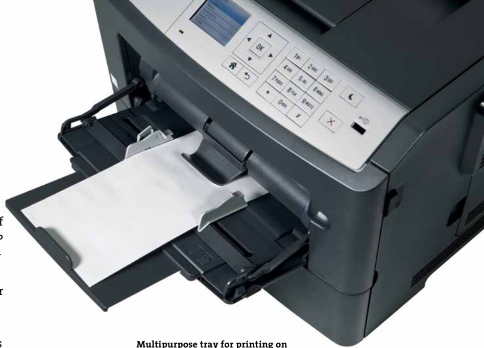
Multipurpose tray for printing on special media such as envelopes

Are high-volume print jobs commonplace in your business? With a maximum capacity of 2,300 sheets you can be sure that the ineo 4700P will not run out of paper. And if you frequently print on different kinds of paper, e.g. with or without your corporate logo, you can have your ineo 4700P equipped with up to three paper trays (with 250 or 550 sheets). If the trays are stocked with different kinds, sizes and weights of paper (A6–A4 and 60–163 g/m 2 ), you ensure your staff to waste no time switching from one kind of paper to another, or running back to a printer that has run out of paper.