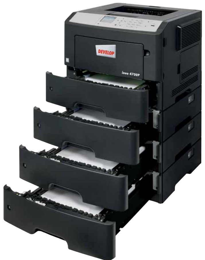
ineo 4700P with three additional paper cassettes (PF-P12)

If the operating system on your current printer is frustratingly difficult to follow and the device difficult to use, it's time you considered switching to an ineo 4700P. Its 2.4-inch colour display ensures intuitive operatability and highlighted menus show users the system's status, operating options and settings. What's more, a folder-like navigation concept means the ineo 4700P is easier to use than many older systems. This saves your staff time and effort in everyday printing jobs. And nobody will have to consult an operating manual before using this new printer.